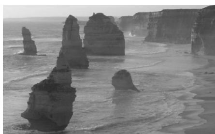
Twelve Apostles Marine National Park, Victoria

Continuing research around the world has further reinforced the findings which relate to the value of nature to health and well-being at both individual and community levels, and to preventative as well as restorative outcomes.