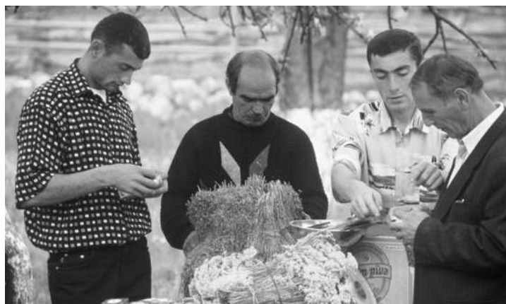
Production of herbs and medicinal plants for the local market by the village community of Topchu, in the buffer zone of the Ismailly Nature Reserve, Azerbaijan.

The development of effective management for protected areas where commercial resource use is acceptable is the key to sustainable trade and hopefully to locally equitable benefit sharing. Effective management can also help combat the well documented problems of over-exploitation of medicinal plants – which is often illegal and an all too common feature inside and outside protected areas. The many examples of trade in illegally collected plants for use in complementary and alternative medicine need not be recounted here, but the example from Great Smoky Mountain National Park in the USA, is illustrative. The equivalent of approximately 8,000 ginseng plants ( Panax quinquefolius ) were confiscated from two different groups of poachers in 1993 leading to the development of detailed protection methods for vulnerable plant species 139 . In Vietnam trade in traditional medicinal plants is poorly researched but in some areas is clearly having a major impact. In Binh Chau Nature Reserve in southern Vietnam, Tinospora crispa was extensively harvested between 1996 and 1998, and is now very rare; similarly in Bach Ma National Park, local herbalists report that several medicinal species have become rare 140 .