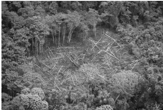
Aerial shot of deforestation in the Amazon, Loreto region, Peru

But these positive links, which are beginning once again to be recognised in the scientific literature and environmental and health policy around the world, continue to be undermined by habitat destruction and loss. Protected areas can offer one of the most permanent and effective strategies to ensure that at least some of our natural world is conserved. We thus conclude this report with a series of recommendations to further the understanding and promotion of the role of protected areas in contributing to human health. The underlying recommendation, however, remains the need for the vision of protected areas defined in the CBD's Programme of Work on Protected Areas of a comprehensive, effectively managed, and ecologically representative national and regional systems of protected areas 407 .