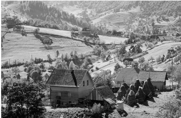
Village of Magura, Piatra Craiului National Park, Transylvania, Romania.