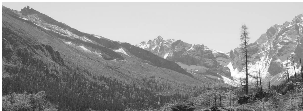
The landscapes of Wanglang Nature Reserve not only contain giant pandas and other rare wildlife, but are also important for conserving many endemic medicinal plant species

This conservation challenge is exemplified in China's Upper Yangtze ecoregion, whose landscapes are a global conservation priority. Spanning a large area of Shaanxi, Gansu and Sichuan, this ecoregion is best known for the 18 conservation areas where the giant panda ( Ailuropoda melanoleuca ) still occurs in the wild. What is less well known is that about 75 per cent of commercially harvested Chinese medicinal plant species occur in the mountains of the Upper Yangtze ecoregion, many of which are endangered due to over-harvesting. Commercial harvest of remaining populations of slow growing and often habitat specific medicinal plants within nature reserves is not just a plant conservation issue. With limited staff, strict controls are difficult in these remote, rugged mountains. As a result, commercial collectors camp within nature reserves during the TCM harvest season, in some cases for two months or more, harvesting TCM species and hunting wildlife as a source of food. When hunting of protected wildlife such as takin ( Budorcas taxicolor ) occurs, then conflicts between conservation authorities and TCM collector's increases, often with negative outcomes for both people and nature.