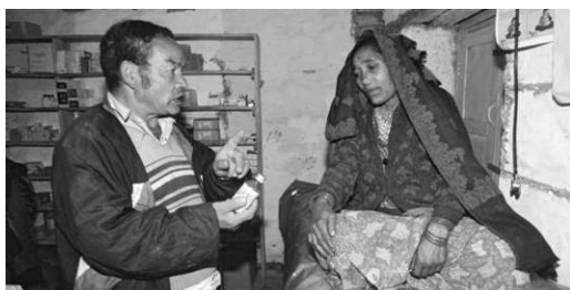
Local doctor prescribing traditional medicine to a patient in the Annapurna Conservation Area, Nepal

Such harmony is required in many parts of the world. The case study from China reviews a joint project being run by WWF-China, TRAFFIC and IUCN, which aims to find harmony between the resources needed for traditional Chinese medicine, the needs for conservation, and in particular panda habitat, and more sustainable local livelihoods and thus well-being. The case study reviews the project’s aims and activities to date. The example from Malaysia illustrates the problems faced by local and indigenous people in conserving their traditional resources. In this case the collection of honey, which has medicinal and nutritional values, is being threatened by forest loss. If the forest is logged the production of high quality honey will cease, local livelihoods and traditions will be lost, an important medicinal product will disappear and biodiversity will be reduced.