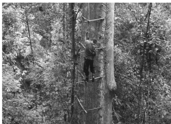
Bee nest in Tualang tree at Ulu Muda (left). Honey gatherer climbing the Tualang tree at Ulu Muda (right)