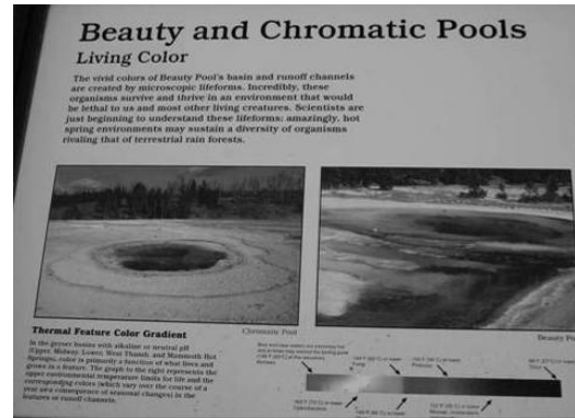
The geothermal features at Yellowstone National Park, USA

The isolation of Taq polymerase from the Yellowstone culture of Thermus aquaticus for use in PCR did not however result in any direct benefits for the National Park Service, the US Federal Government or the US public 308 . Not surprisingly this situation brought the issue of benefits-sharing agreements for future bioprospecting in Yellowstone to the forefront. Policies and legislation were developed and finally the National Parks Omnibus Management Act of 1998 (NPOMA) was passed, which authorises ‘negotiations with the research community and private industry for equitable, efficient benefits-sharing arrangements’ in connection with research conducted in national parks. NPOMA provides guidance to national parks on developing benefits-sharing agreements with the research community and mandates increased scientific research in protected areas. The legislation specifically authorises the US National Park Service to negotiate agreements for profit-sharing when park-based research results in a product with commercial value 309 .