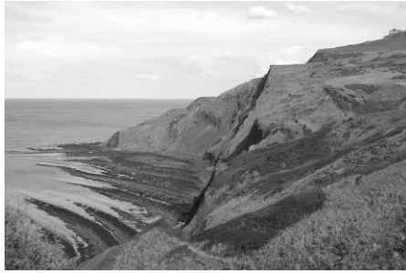
North Yorkshire Moors National Park, England