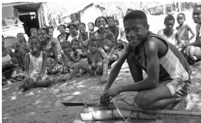
Preparing forest tubers to eat in the Spiny Forest area, Madagascar

In terrestrial protected areas the relationship is not always so positive. Research in Thailand found that closing off forests to local people, who eat about a hundred plant species, led to reduced food supply 346 . However, in cases where protected areas incorporate a sustainable harvest of food products for local communities, conservation strategies can ensure that natural resources are not depleted, while simultaneously protecting biodiversity. Such a balance is not necessarily easy to achieve and can lead to tensions, disputes and protracted negotiations. Also, interventions in terrestrial areas often take longer to bear results than in marine areas. There are nonetheless many working examples of such systems including for example the conservancies of Namibia and the many Indigenous and Community Conserved Areas that exist around the world. Such opportunities often provide a safety net for some of the most remote, poor and food insecure people when crops and livestock fail. For example, in April 2005, local communities in parts of the Spiny Forest, Madagascar, had lost their crops in a cyclone and were surviving on tubers and other foods collected daily from their local forest. The communities greatly valued the forest for food security and also as a source of medicines. Even in normal times wild foods from protected areas can ensure a more balanced diet, supplementing staples such as maize and cassava.