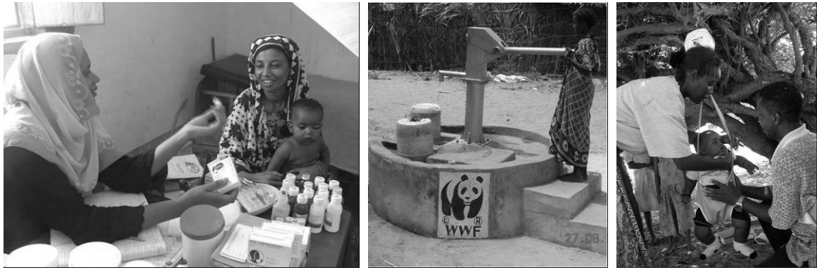
Pictures left to right: Consultation at Mkokoni clinic © Cara Honzak/WWF-US; New well, Kiunga © WWF Kiunga Project; Baby weighing during a mobile clinic © Cara Honzak/WWF-US

In order to reduce maternal mortality the project has encouraged women to deliver their babies at health care facilities rather than at home. Health facilities were equipped with delivery kits and the referral system by traditional birth attendants was strengthened. Deliveries at facilities have increased in Lamu East from 29 to 35 per cent.