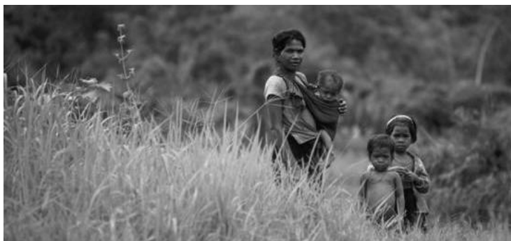
Stieng mother and her children in Cat Tien National Park, Vietnam