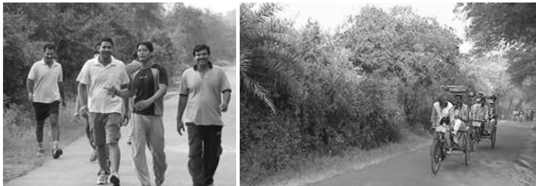
Morning walkers and rickshaw pullers at KNP

Amidst the urban landscape of Bharatpur town, the forests and wetlands of KNP attract hundreds of people, both men and women, who visit the park every morning to walk inside and enjoy the fresh air, beauty and tranquility. The park has designated ca 2km stretch which 'morning walkers' enjoy every day between 5 and 7 am.