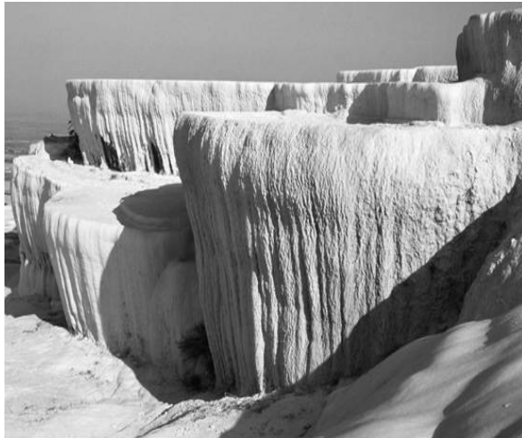
The petrified springs at Pamukkale Protected Area, Denizli Province, Turkey

In the 19 th Century, before antibiotics were available to treat disease such as tuberculosis, sanatoriums hoped to create the ideal conditions for fighting infections by providing a regime of good food, rest and a healthy environment. The first sanatoriums were opened in Germany in the 1850s with treatments based around exposure to open-air, preferably at high altitude 228 . Today, many protected areas still have sanatoriums within them: for example, Sanatorium Energetick in Tunkinsky National Park in Siberia, Sanatorium Amber Shore in Kemer National Park in Latvia and Rakhmanov's Springs Sanatorium in Katon-Karagai State National Nature Park in Kazakhstan.