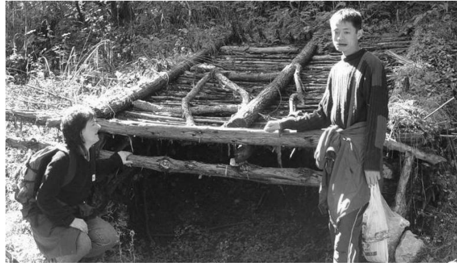
Millions of Fritillaria cirrhosa ( beimu ) bulbs, all wild collected, including from within nature reserves, are sold for industrial production of cough remedies ( left ). Frame constructed within a nature reserve by commercial medicinal plant harvesters for drying rhizomes of Notopterygium ( qianghou ) an endemic genus only found in China ( right ).