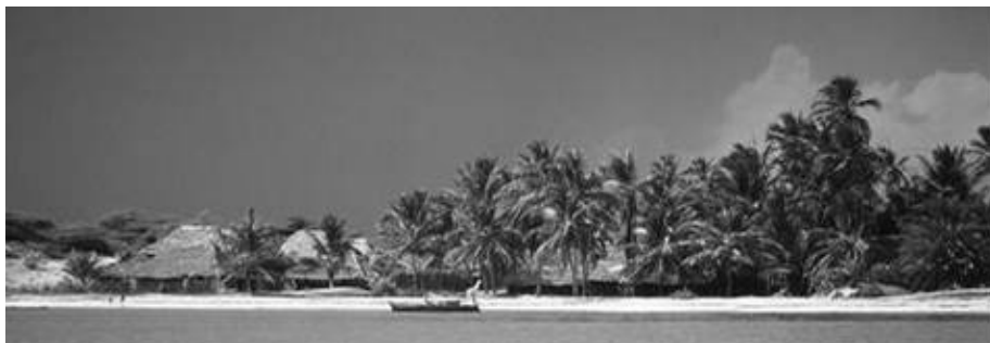
Mkokoni village, Kiunga Marine National Reserve, Kenya

The area provides few opportunities for permanent employment, resulting in high direct dependence on natural resources. The local coastal communities are predominantly Bajuni of Arab and Bantu ancestry who number about 15,000 people and whose traditional livelihoods include fishing, mangrove harvesting, subsistence farming and animal husbandry. Inland, around 4,200 Boni people rely on small-scale agriculture and honey-harvesting; former hunter-gatherers, they still collect edible and medicinal plants from the Dodori and Boni Reserves.