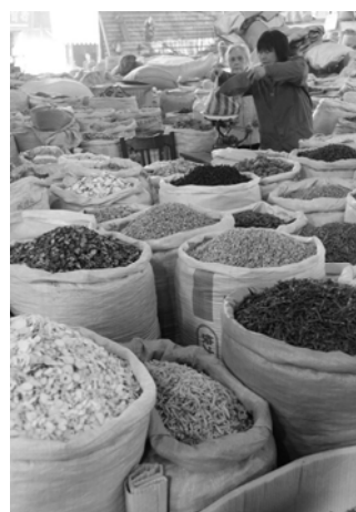
EU-China Biodiversity Programme project area (left). Xian market (right)