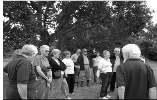
Tiptree Heath, Essex: An Art walk as part of the summer 'Going Ratty' day about small mammals for younger generation (left) and health walks for the more mature (right)