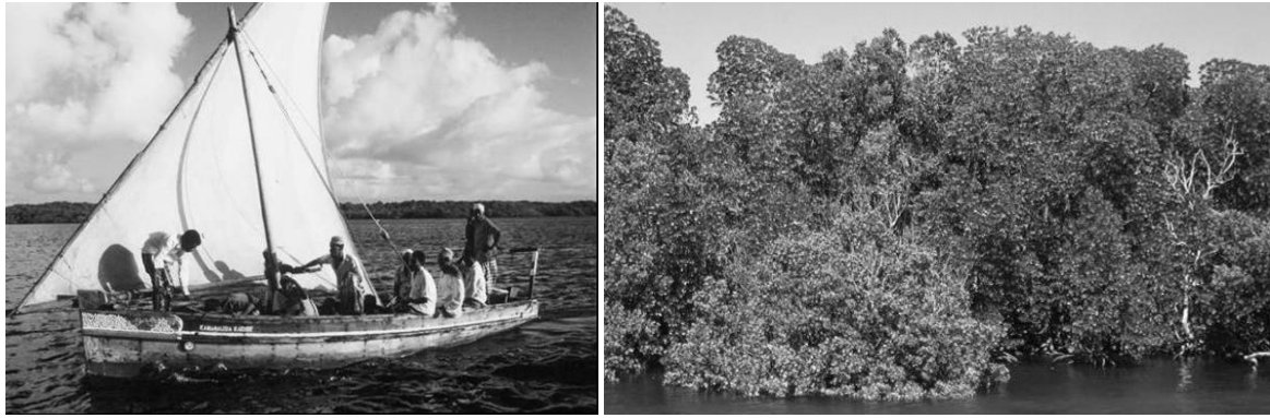
People rely on dhows (boats) for their livelihood and transport in Kiunga (left:) and on the mangrove forests ( Rizophora maculata) for resources (right:).

The main health issues in remote Lamu District before the PHE project started were maternal and child health problems, malaria and HIV/AIDS, exacerbated by illiteracy, taboos and lack of information. Nationally, Kenya's population is growing at 2.8 per cent per year; it has a total fertility rate of 4.9 births per woman 296 , and an unmet need for family planning of 24 per cent 297 . This case study describes how WWF's Kiunga programme has undertaken PHE work to improve the health of people and the environment. The project received funding from Johnson & Johnson for health and environment activities, and from USAID for family planning/reproductive health activities linked with environmental education.