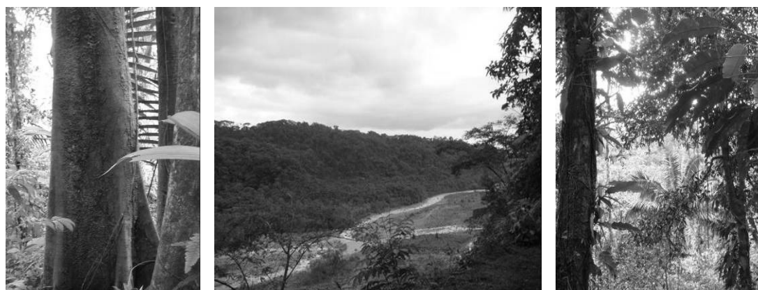
Braulio Carrillo National Park, Costa Rica

Each agreement has a work plan and research budget that includes a 10 per cent donation to the Ministerio del Ambiente y Energía (MINAE) (Ministry of the Environment and Energy), which helps cover direct biodiversity conservation costs. The agreements can also contribute to species identification, sample collection and preparation, collection records, information management, training, management, etc. The agreements stipulate that if benefits are derived from the discovery of a successful product, 50 per cent of the royalties which INBio receives according to the agreement will be donated to the Sistema Nacional de Areas de Conservación (National System of Conservation Areas) and the rest will be invested in continuing the process and other INBio activities.