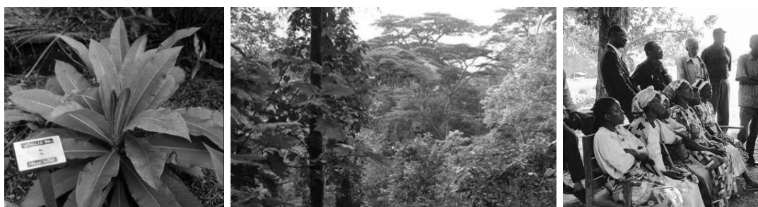
Ethnobotanical garden Ruhija, Bwindi Impenetrable National Park, Uganda (left) © Frederick J. Weyerhaeuser / WWF-Canon. Bwindi forest (middle) and local community (right) © Marc Hockings

Where such systems exist protected areas can provide a safe and sustainable resource for local medicines. In Bwindi Impenetrable National Park (BINP) in southwest Uganda, for example, the park management has been working with local people to develop sustainable resource use after many years of conflict over access to resources in the protected area. Community consultation meetings were convened by BINP managers and researchers to develop recommendations for monitoring programmes and community memorandums of understanding (MoUs) on resource use in the park 122 . The meetings confirmed that demand for forest resources are high and continued monitoring is important; they also agreed zoning options 123 . Monitoring programmes for three plant species ( Ocotea usambarensis , Rytigynia kigeziensis and Loeseneriella apocynoides ) that are used for medicine and craft materials have been developed and agreements on resource use agreed with members of the local community 124 .