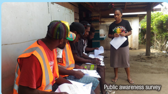
Public awareness survey