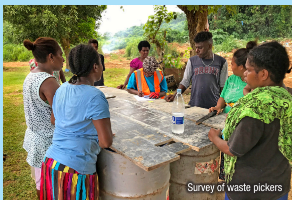
Survey of waste pickers