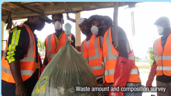
Waste amount and composition survey

Baseline surveys were conducted by PVCC staff to comprehend the current waste management situation (2017)