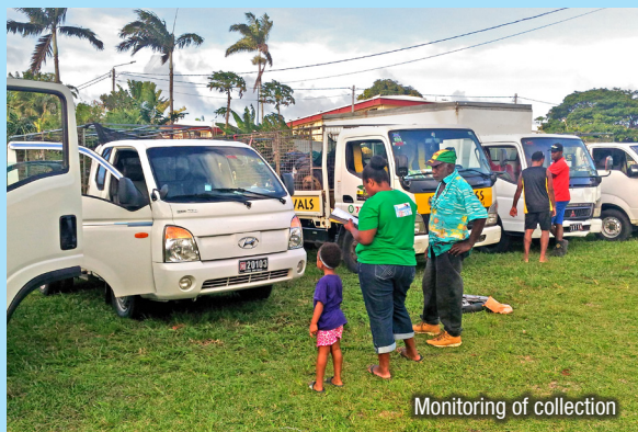
Monitoring of collection