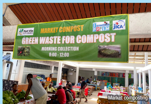
Implementing pilot projects for the SWM plan (2020)

As part of the planning process, eight pilot projects were implemented to verify the effectiveness and feasibility of the plan. Some of the pilot projects are shown in the pictures below.