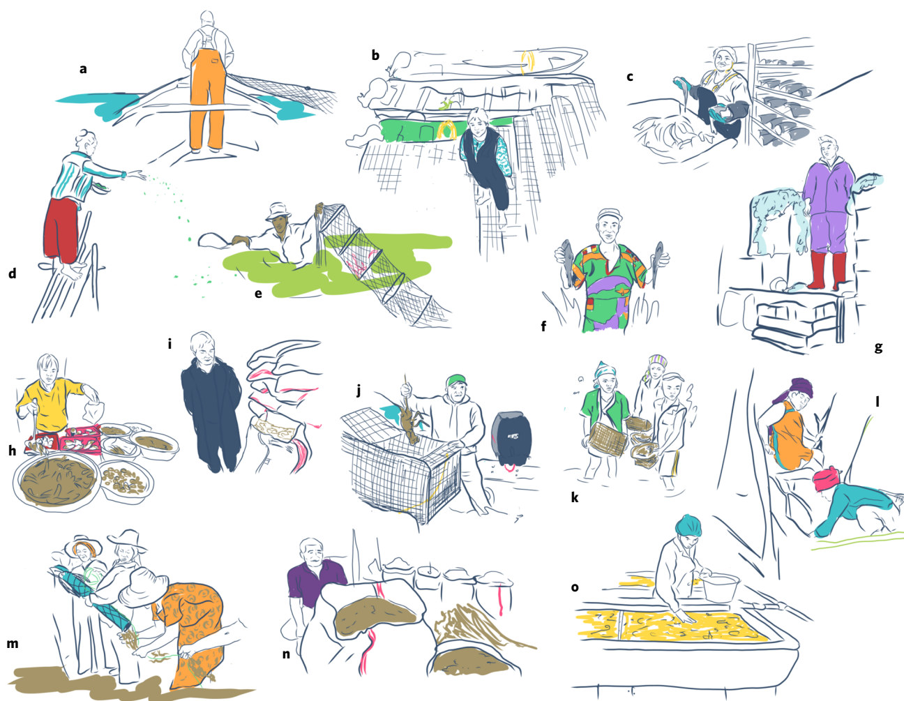
Fig. 1 | Profiles of 15 small-scale actors selected as examples from 70 case profiles representing producers from marine and freshwater fisheries and aquaculture, traders and processors across diverse geographies and demographics. a , Inland Canadian lake-fisher and retail entrepreneur channelling catch to domestic and US markets (Supplementary Table 2, #SSFA-8). b , Rural Chilean fisherwoman targeting multiple species, including benthic gastropods, in a collective territorial user rights system (#SSFA-10). c , Processing plant worker from a fishing cooperative in Baja California, Mexico (#SSFA-45). d , Monosex Nile pond tilapia farmer in Myanmar (#SSFA-53). e , Mangrove integrated organic shrimp farmer in Vietnam (#SSFA-65). f , Pluriactive Zambian crop farmer and fisher, who is also a new fish farmer (#SSFA-67). g , Middleman in Guangdong province, China (#SSFA-17). h , Chinese businesswoman buying a variety of species wholesale to sell to Shanghai residents (#SSFA-18). i , Feed producer for the commercial tilapia aquaculture sector in Kenya (#SSFA-32). j , Lobsterman, finfish and shark fisher from a cooperative in Mexico, geared towards the tourist-based commercial market (#SSFA-47). k , Child gleaners in Madagascar use handwoven baskets to collect freshwater shrimp, crabs and small fish (#SSFA-42). l , Indigenous i-Taukei (Fijian) fisherwomen collect mud crabs from mangroves (#SSFA-23). m , Women seaweed farmers using tubular net technology in Zanzibar, Tanzania (#SSFA-59). n , Market trader of dried fish in Myanmar's coastal Ayeyarwady region (#SSFA-52). o , Shellfish processor supplying yellow clams to the Uruguayan luxury restaurant market (#SSFA-60).

SSFA actors show important differences in the possibilities for diversification. In general, diversification can grant flexibility to an individual's operations, securing them against certain risks and enabling adaptability, as recently demonstrated by responses to the COVID-19 pandemic 4,9 . Flexibility to move between occupations can also provide conditions that support adaptive responses 26 . However, diversification is not always a positive characteristic; it may be an outcome of necessity rather than opportunity 27 . Efficiency or consolidation may be effective in certain operations and contexts, such as processing of high-value resources or transportation logistics. Furthermore, diversification should not undermine the importance of value-chain coordination, much of which is informal within private-sector networks.