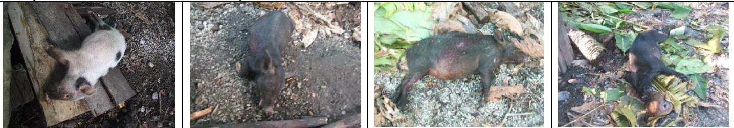
Pigs found and killed

Six of the pigs were females and one male, pigs shot and escaped were wounded badly and they would most likely not last for at least another day.