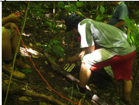
Trap before the trail to the top (2)