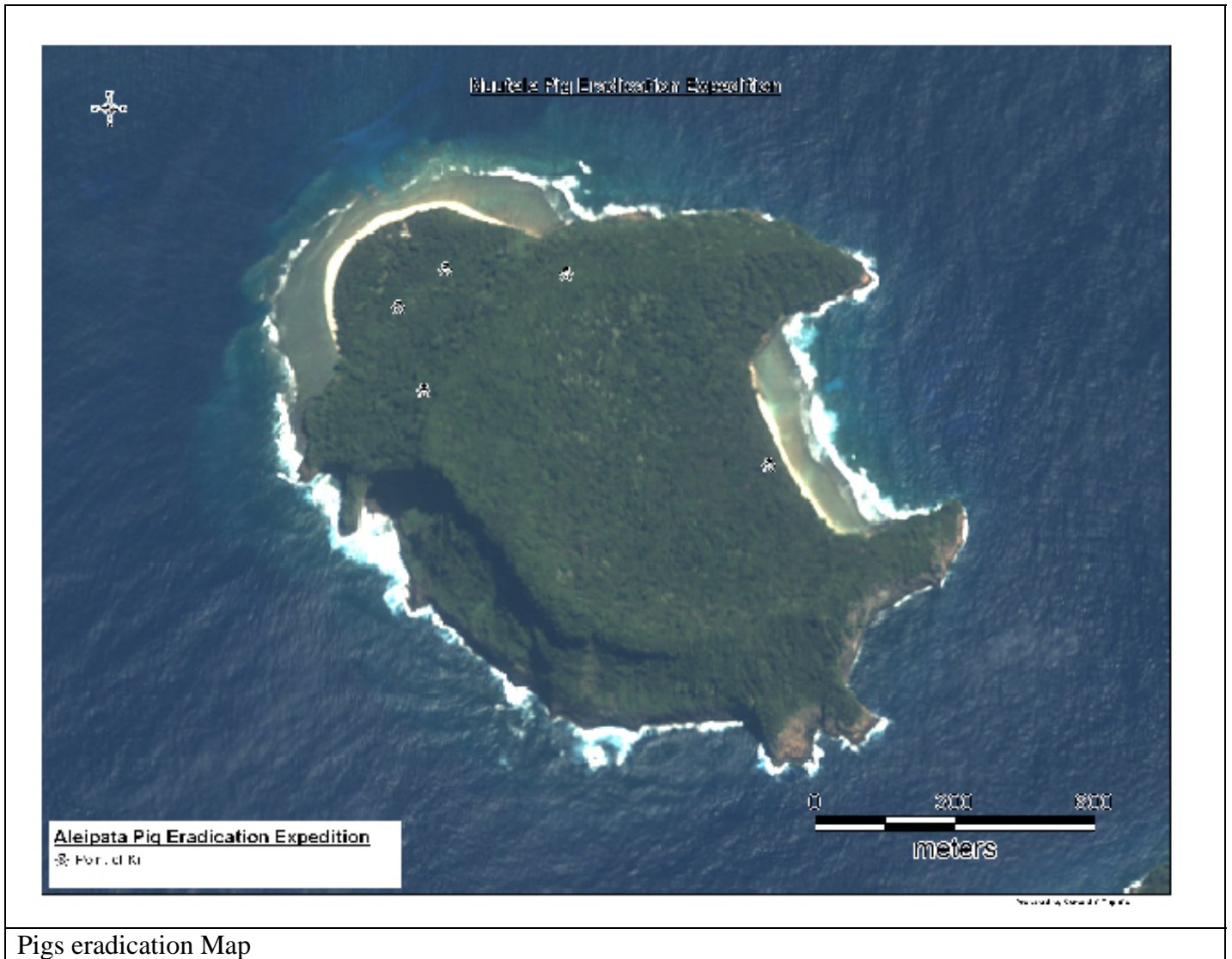
Pigs eradication Map

Reported Samani C Tupuifa. Terrestrial Conservation Section.