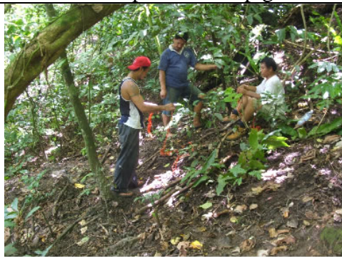
Trap close to the top (1)

Set out two traps one before the trail to the top of the island which is also the pigs trail pic 2&3 and the other close to the top where the pig bonds are pic (1) Refer to the pics below.