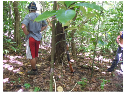
Isamaeli with the riffle (3)